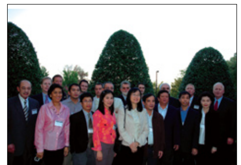
Tobacco Associates recently hosted a delegation of international buyers.