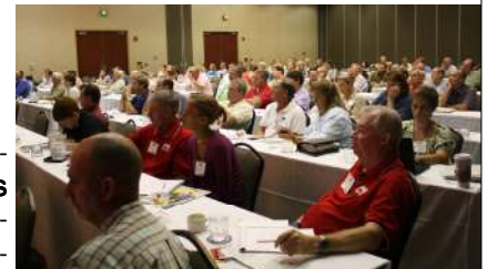
Attendees listen during one of the many workshops.